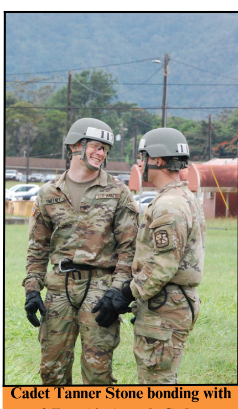
fellow Air Assault Cadet

If you want to go or are unsure if you want to, I advise you to try it. You will meet friends within the two weeks you go that will impact you for the rest of your life. If you're scared, thats ok. I went from getting scared on the Bearkat Orientation Obstacle course to jumping out of helicopters; life is about getting out of your comfort zone and trying new things. Throughout this summer, my experience at Air Assault School reinforced my love for the Army, and I wish all future cadets the chance to go.