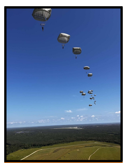
Cadet Jacob Clement's class Final Jump